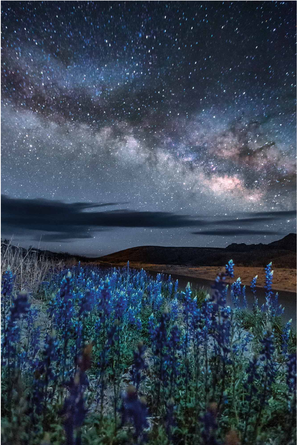
Bluebonnets in Terlingua